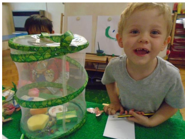
We have butterflies!